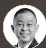
Ignasius Jonan President Commissioner MARSH Indonesia